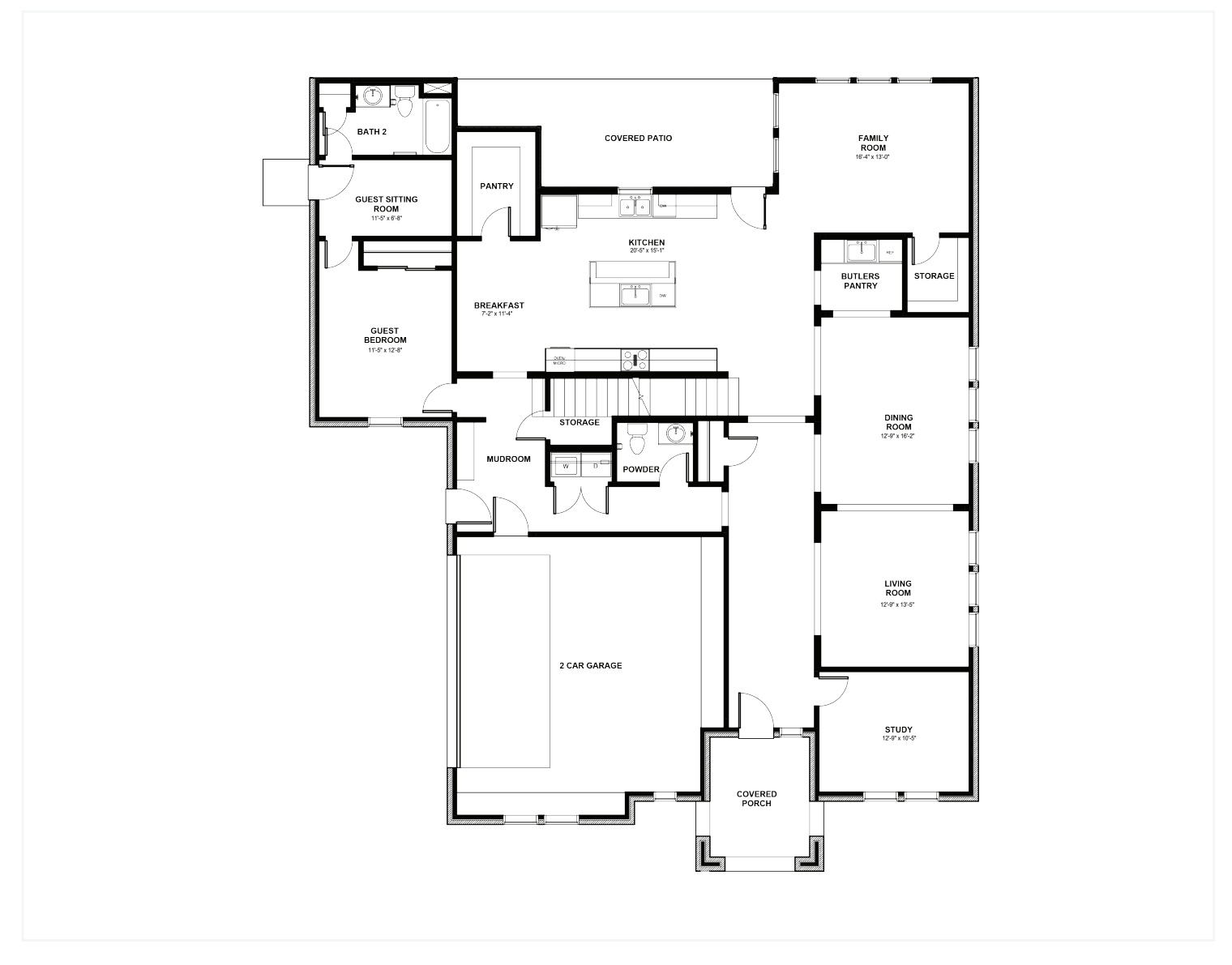
This plan is for preliminary review and may be modified. All square footages are approximate.