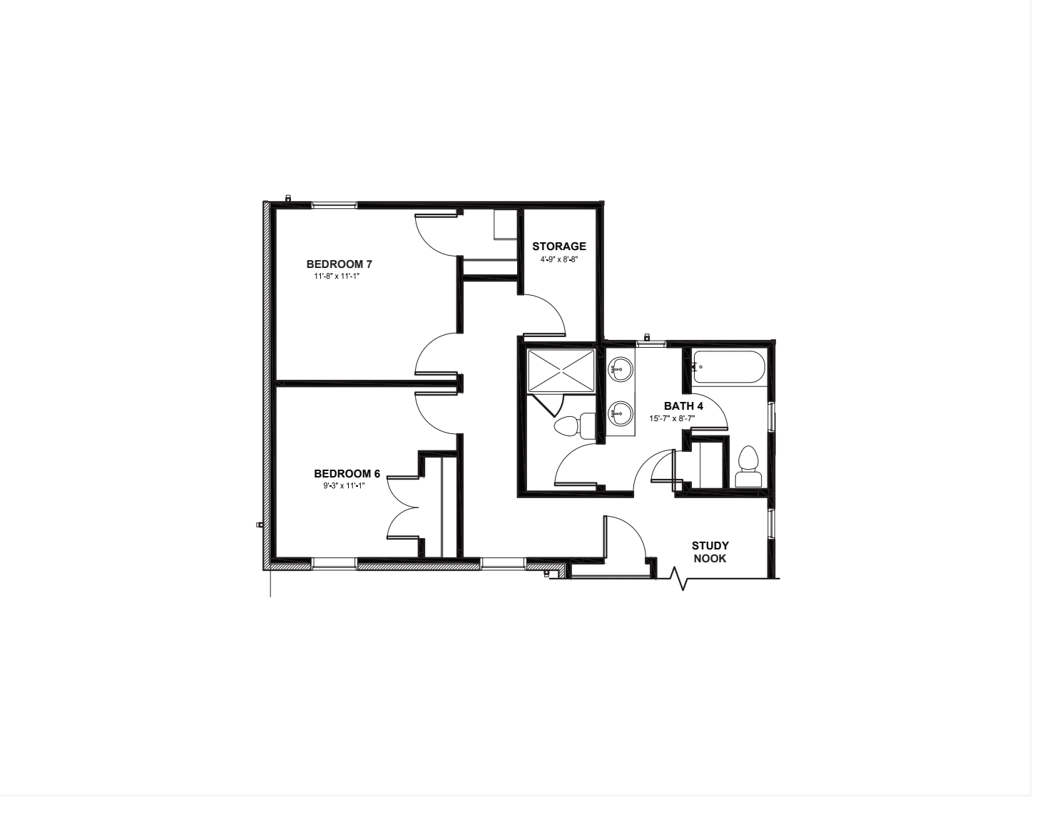
This plan is for preliminary review and may be modified. All square footages are approximate.