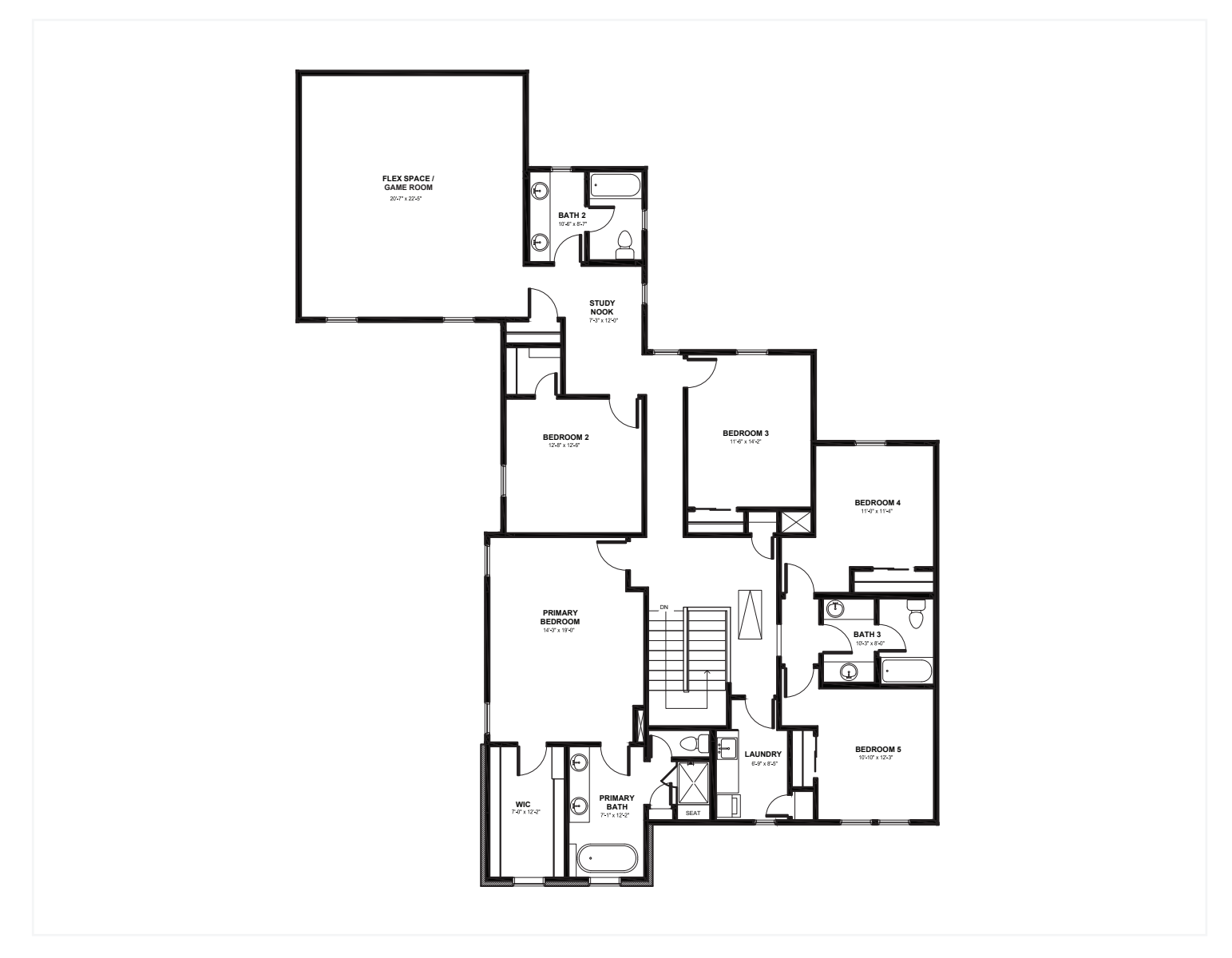
This plan is for preliminary review and may be modified. All square footages are approximate.