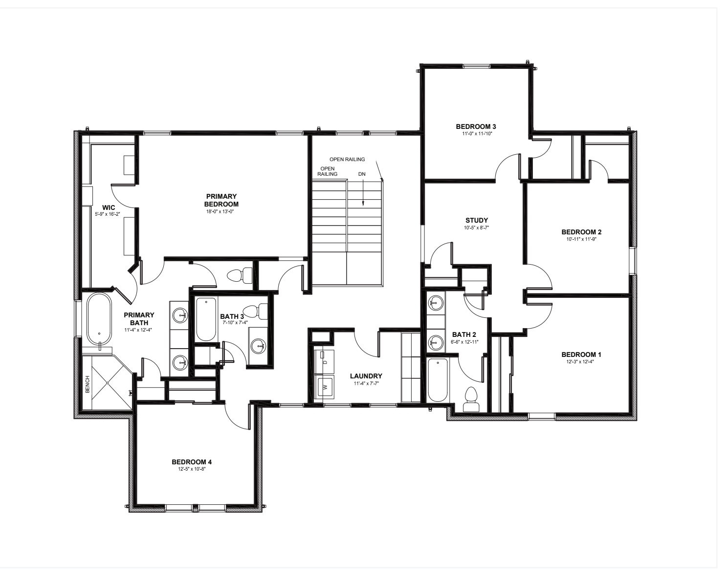
This plan is for preliminary review and may be modified. All square footages are approximate.