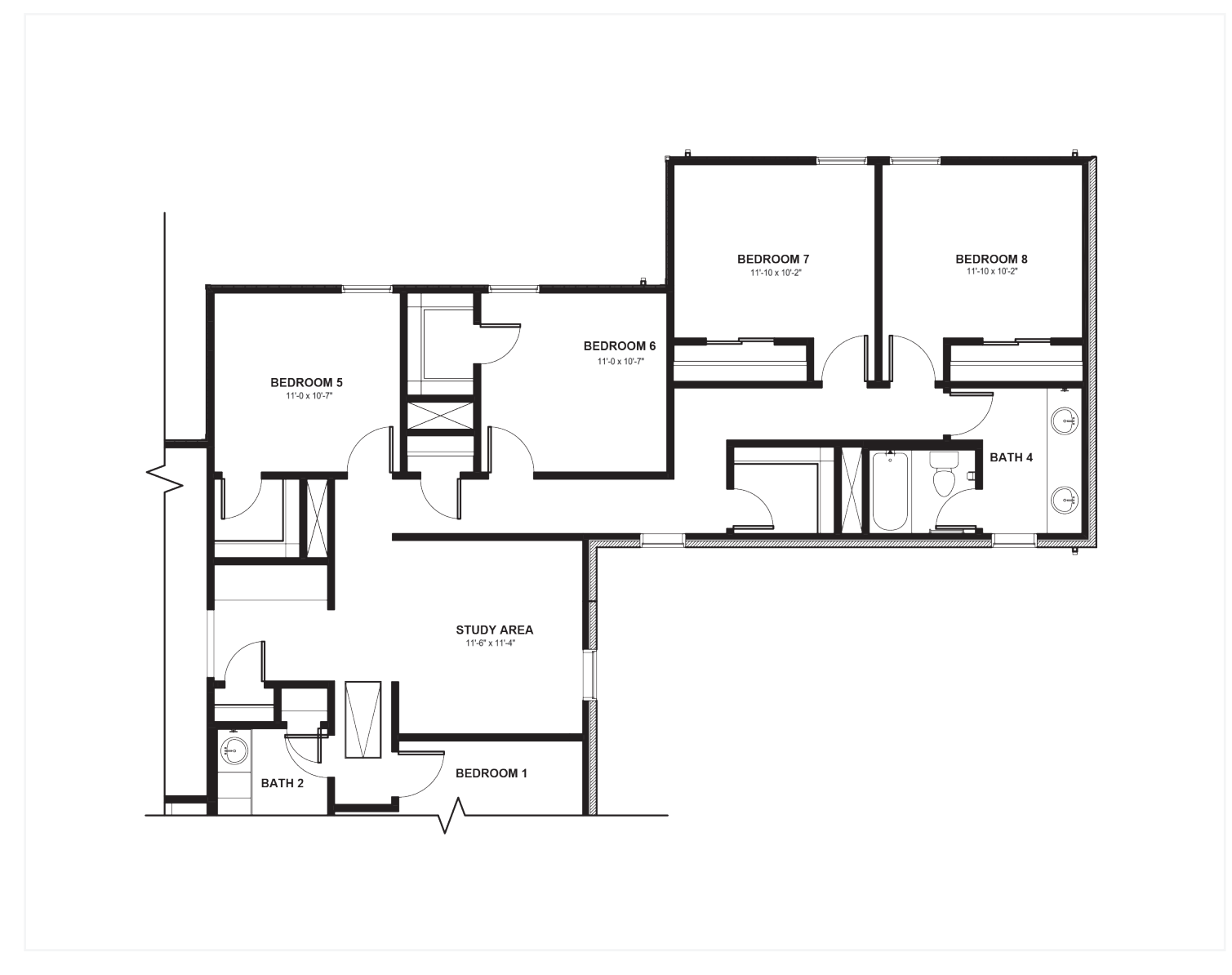
This plan is for preliminary review and may be modified. All square footages are approximate.