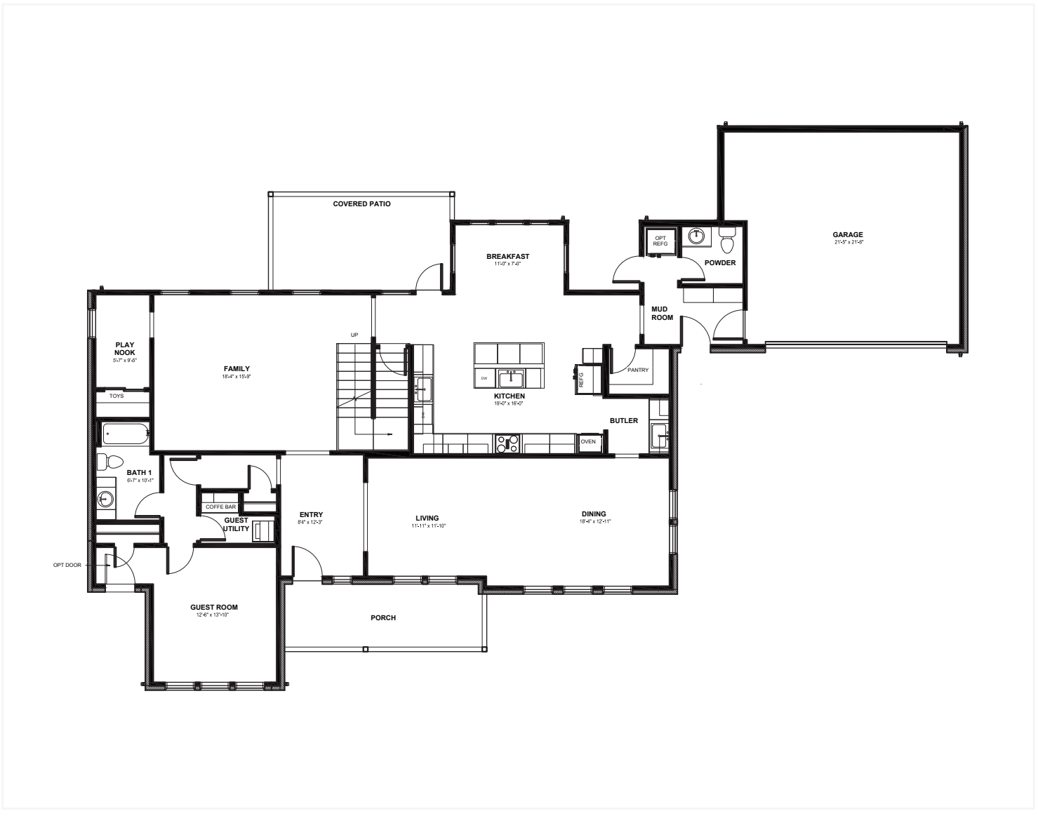
This plan is for preliminary review and may be modified. All square footages are approximate.